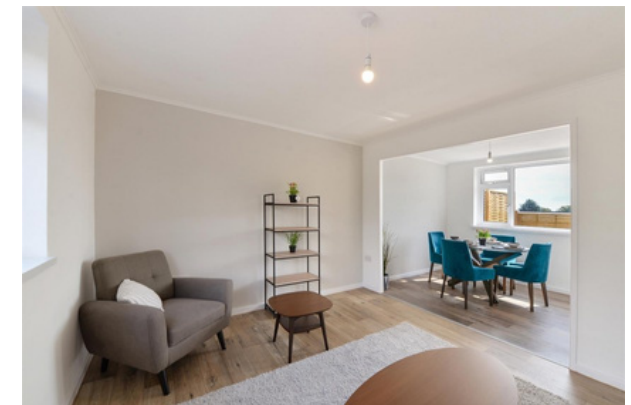
Flats at Mid Kent Shopping Centre, Maidstone, ME16 0PU