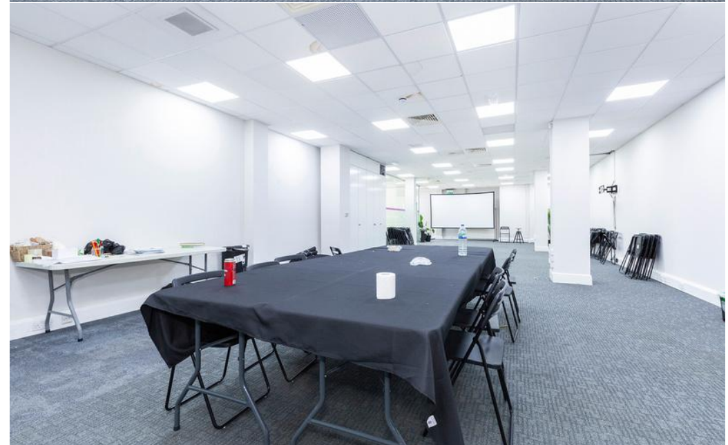
31a Scarborough Street and 7 East Tenter Street